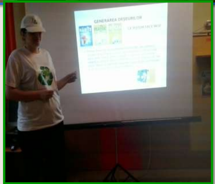
Researching from the school library to improve the environment