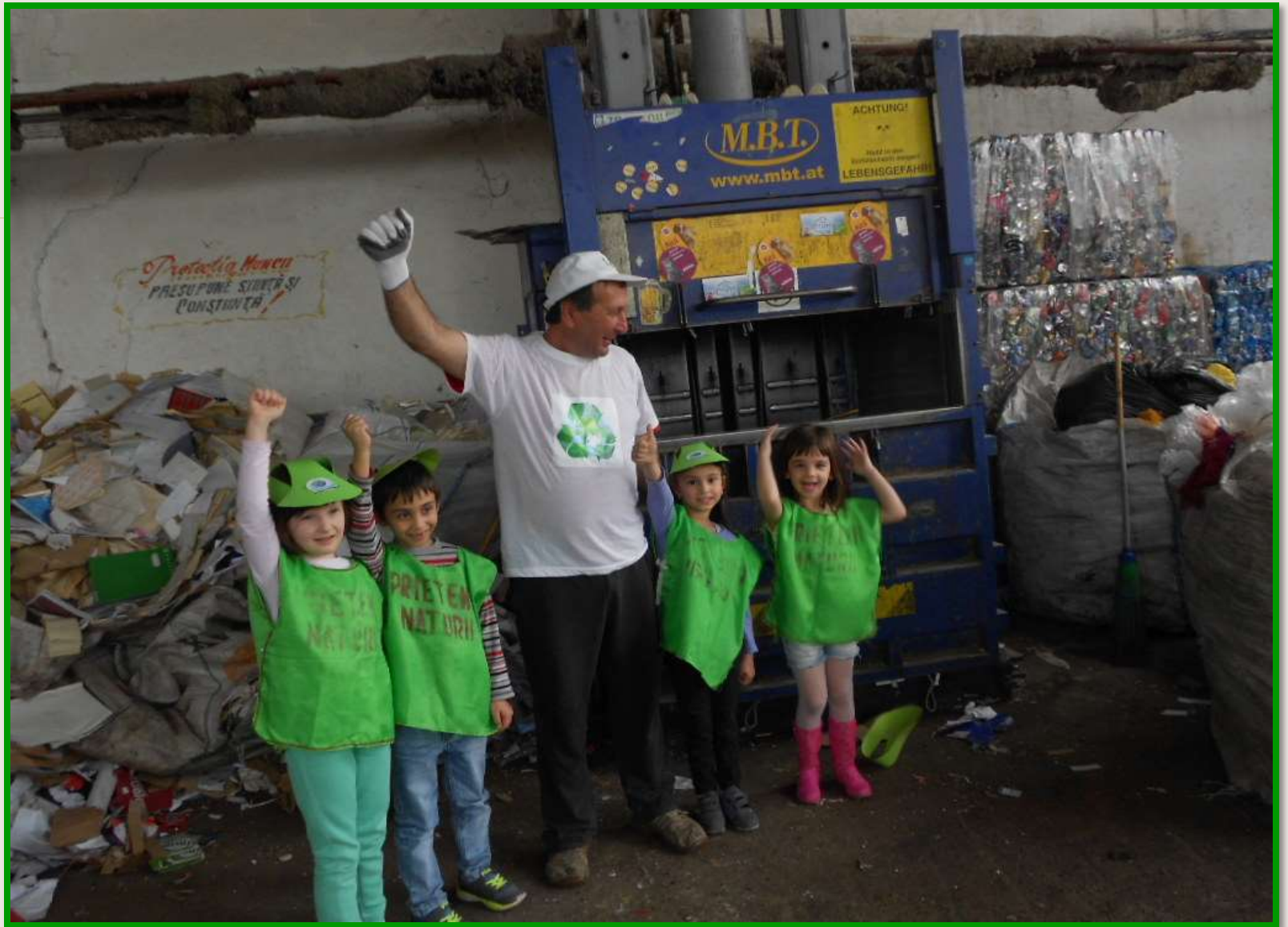
Researching from the school library to improve the environment"