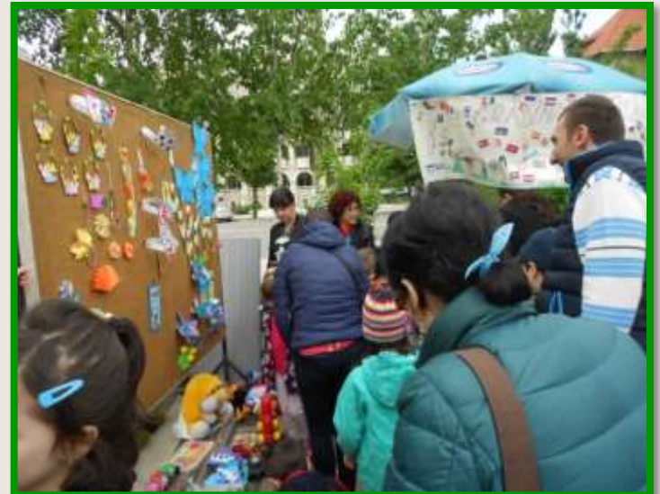
Researching from the school library to improve the environment