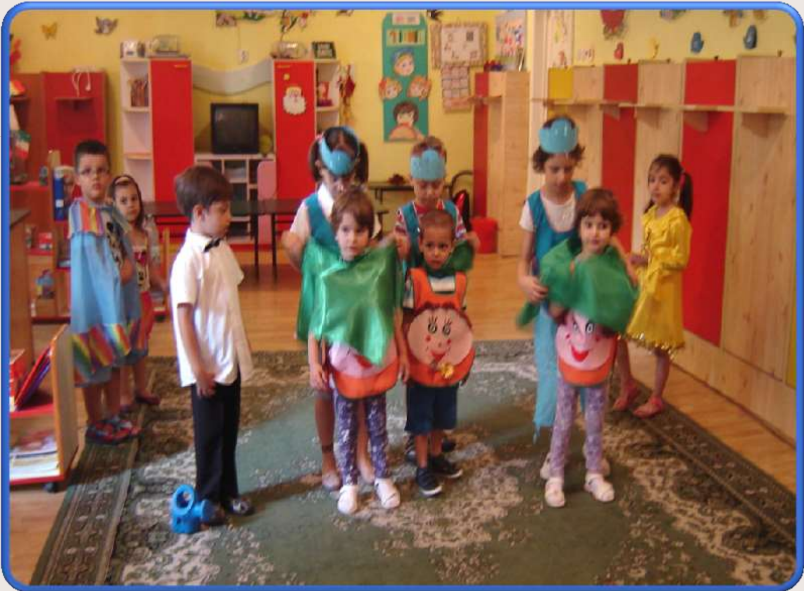
Researching from the school library to improve the environment