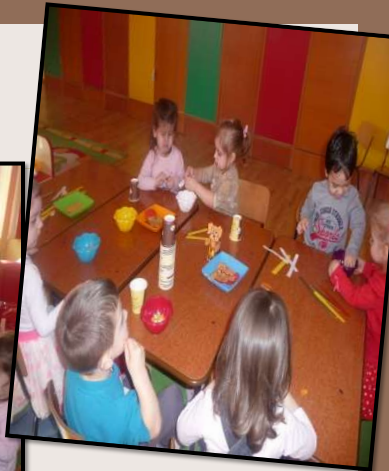
Researching from the school library to improve the environment”