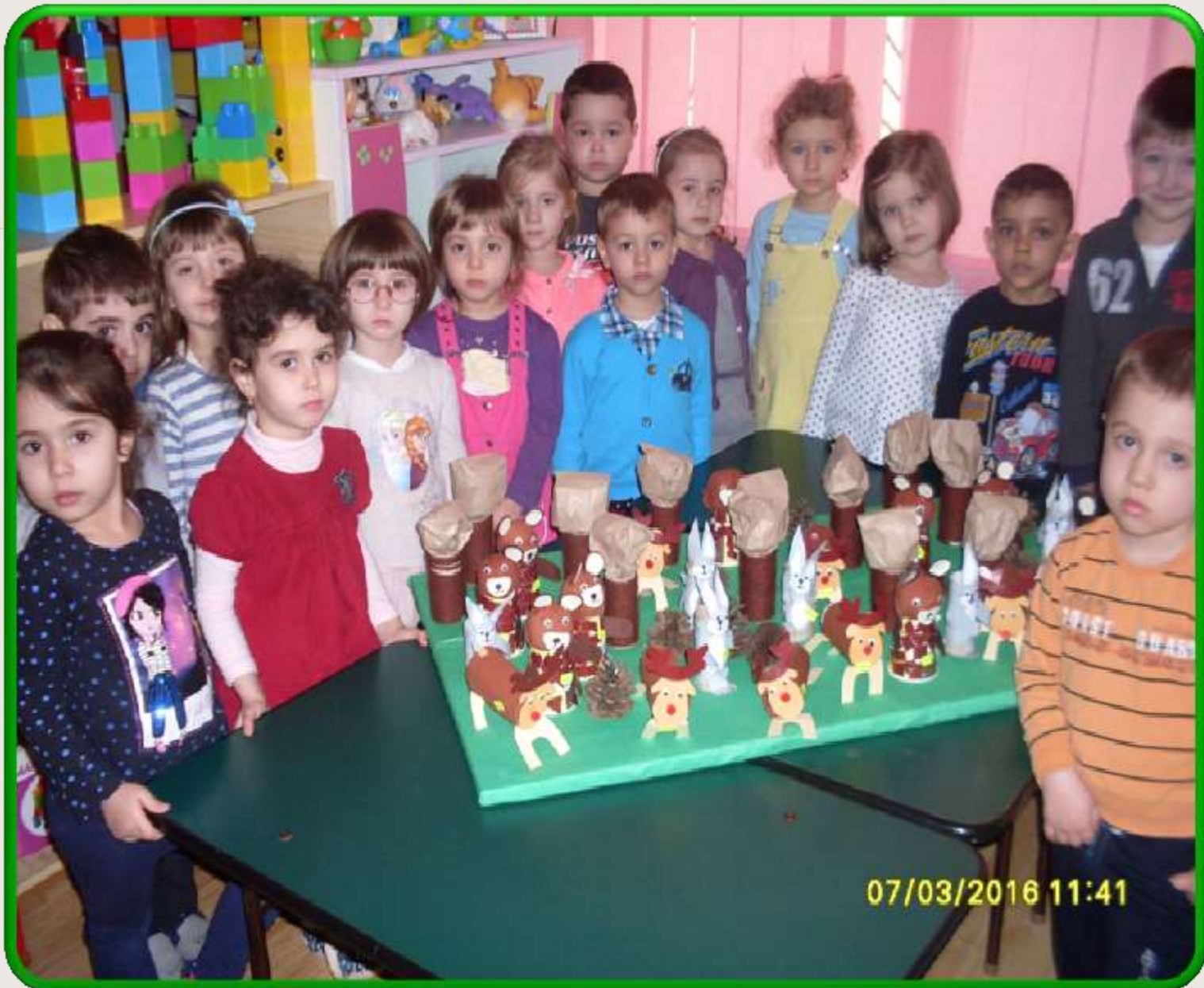
Researching from the school library to improve the environment