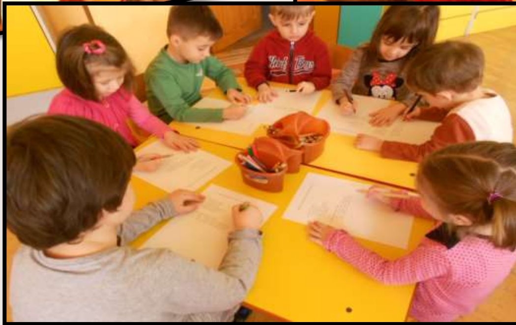
Researching from the school library to improve the environment