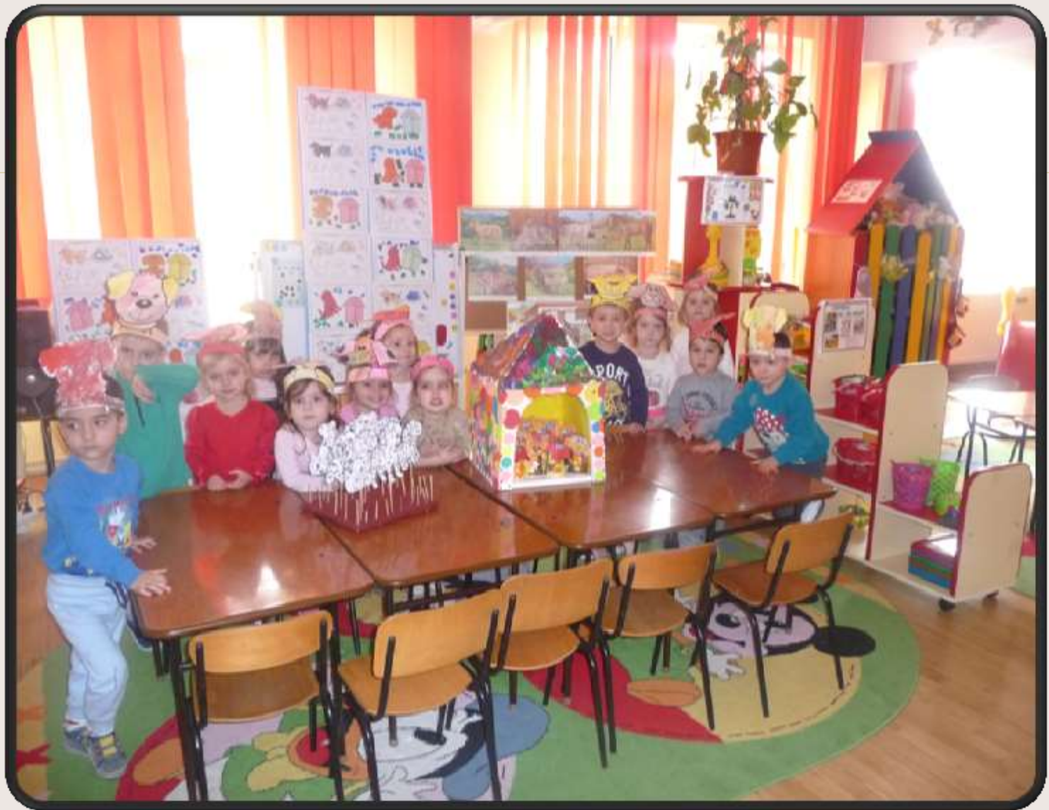
Researching from the school library to improve the environment