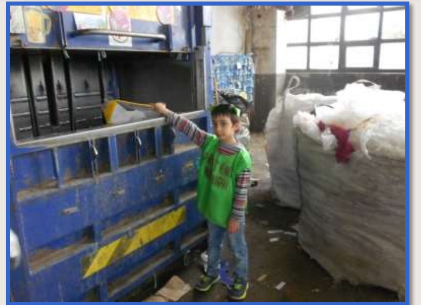
Researching from the school library to improve the environment?"