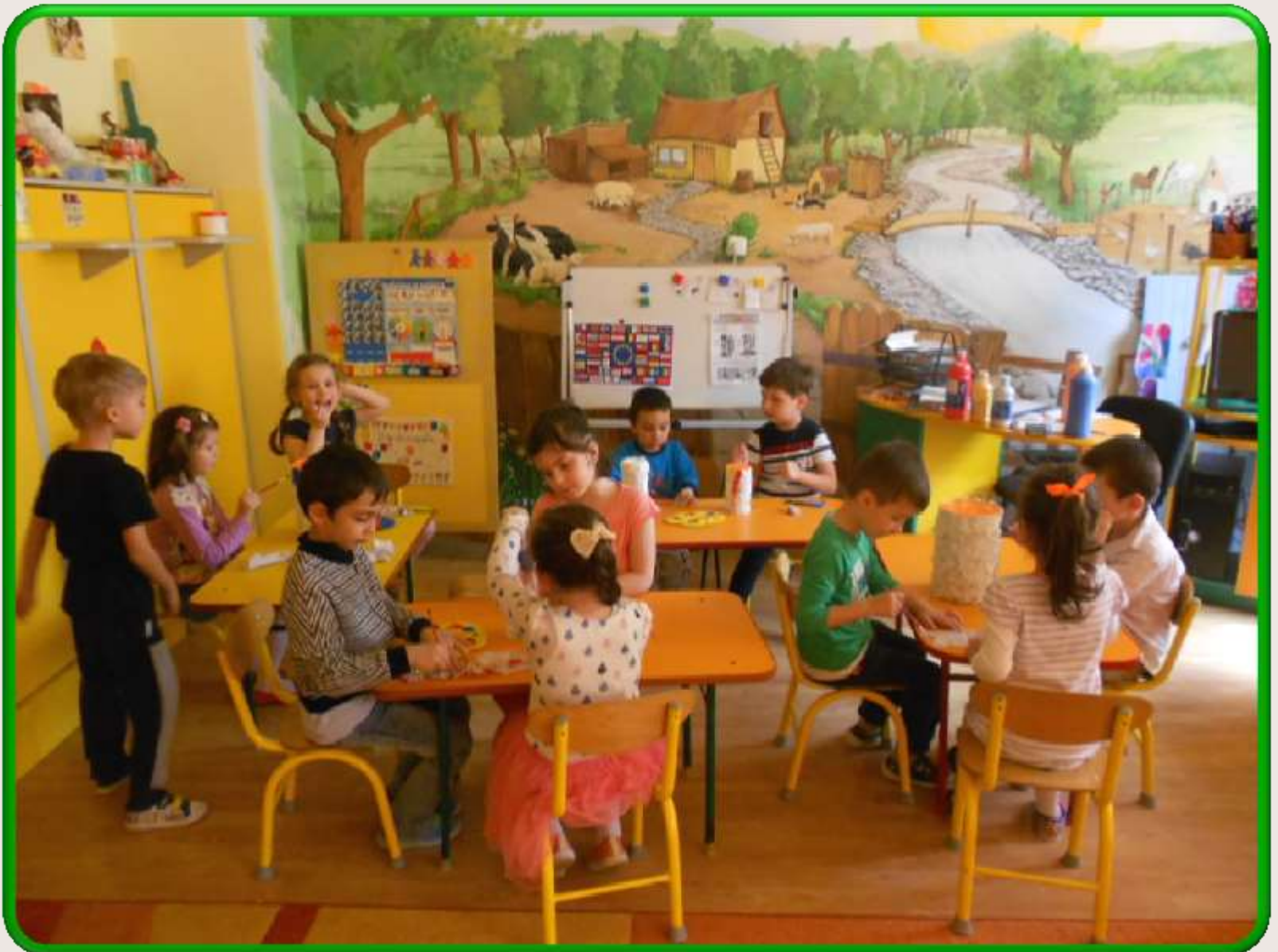
Researching from the school library to improve the environment