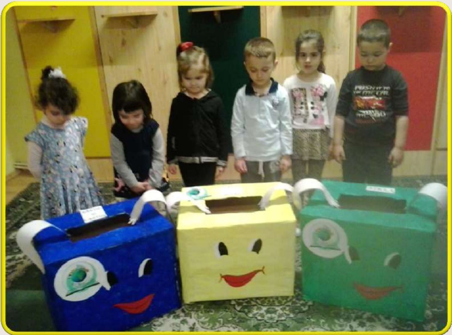
Researching from the school library to improve the environment