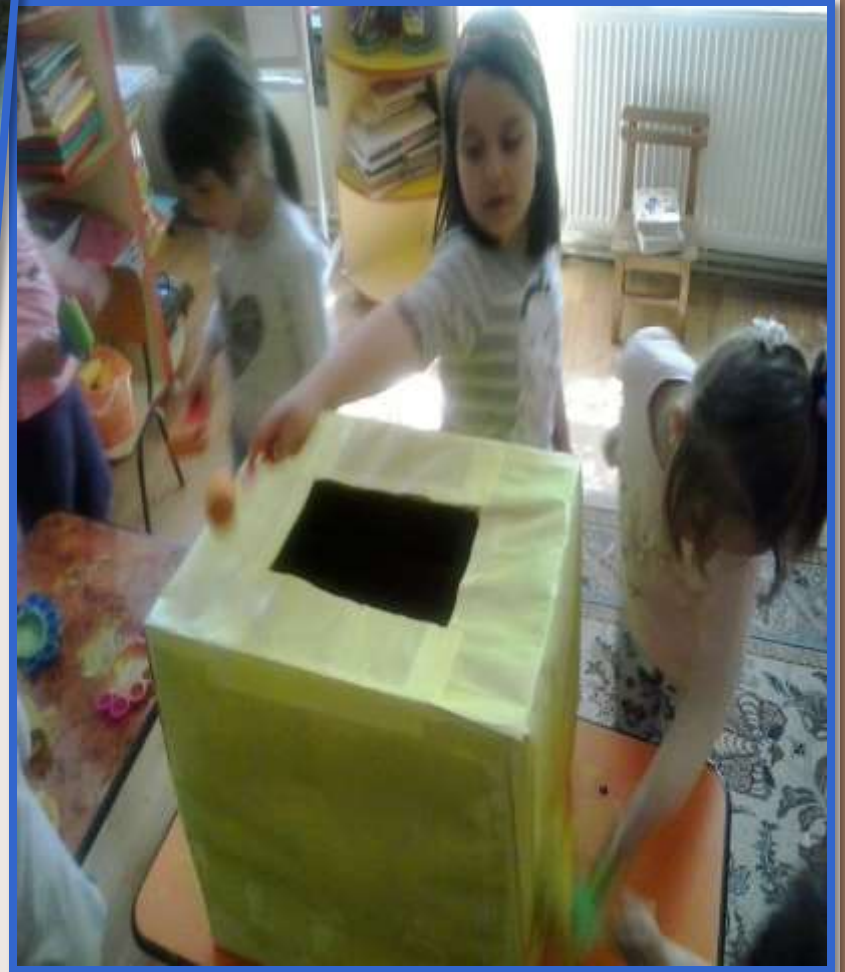
Researching from the school library to improve the environment