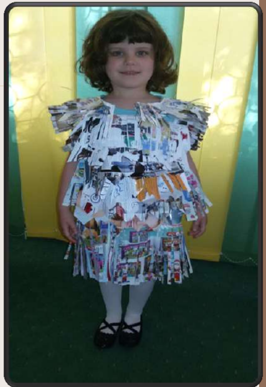
Researching from the school library to improve the environment?"