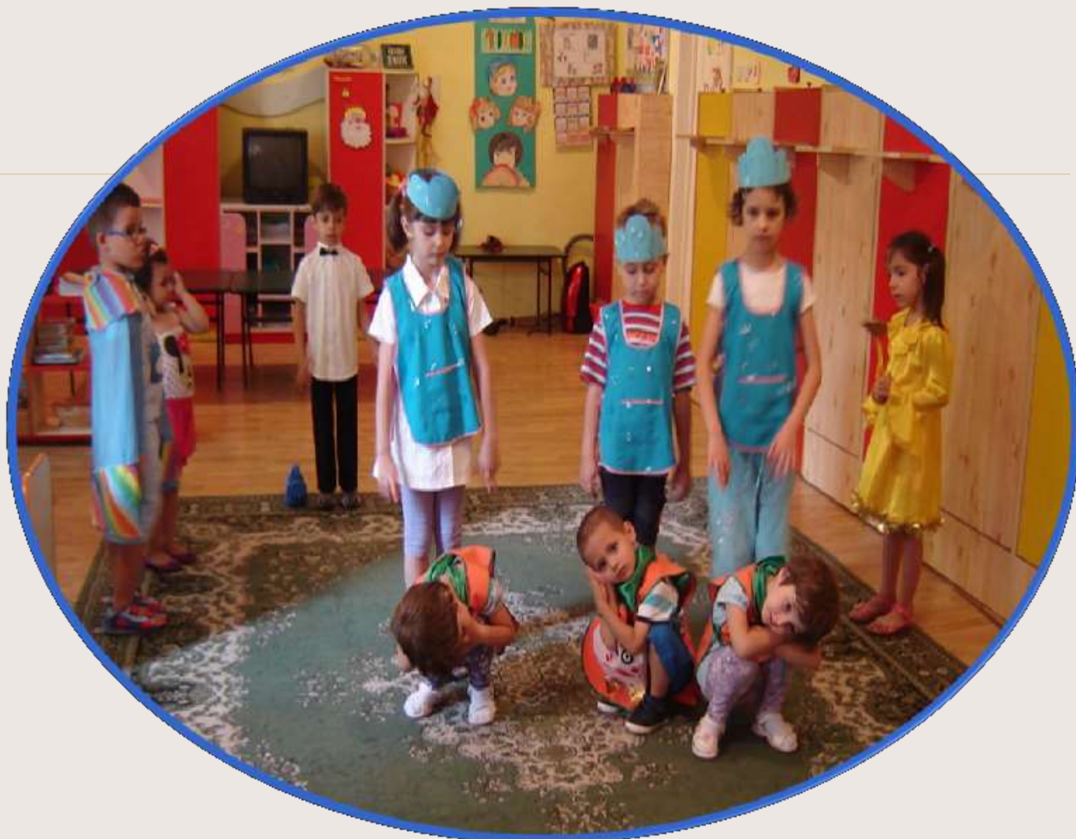
Researching from the school library to improve the environment