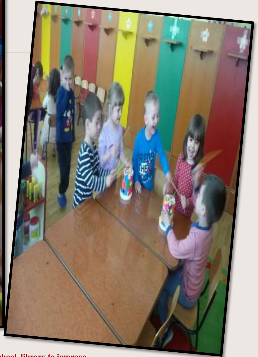
Researching from the school library to improve the environment