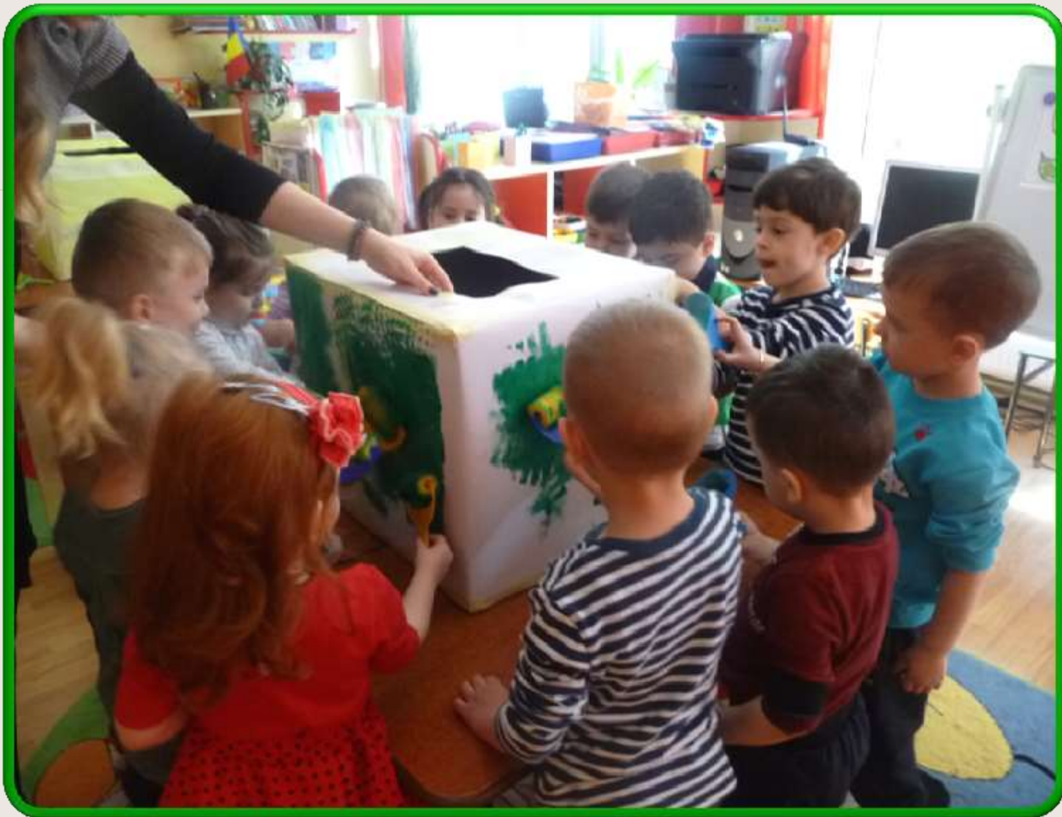
Researching from the school library to improve the environment