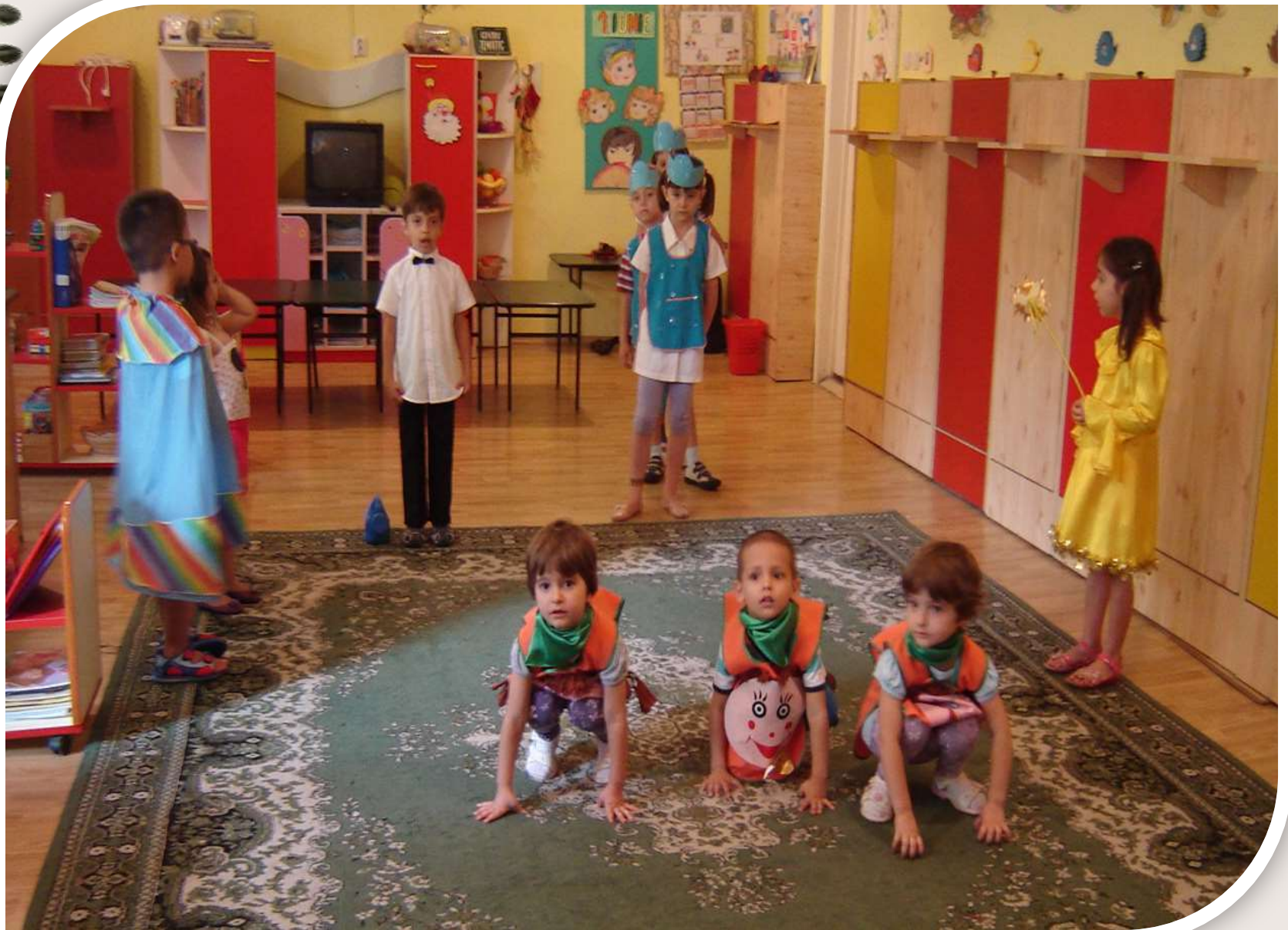
Researching from the school library to improve the environment