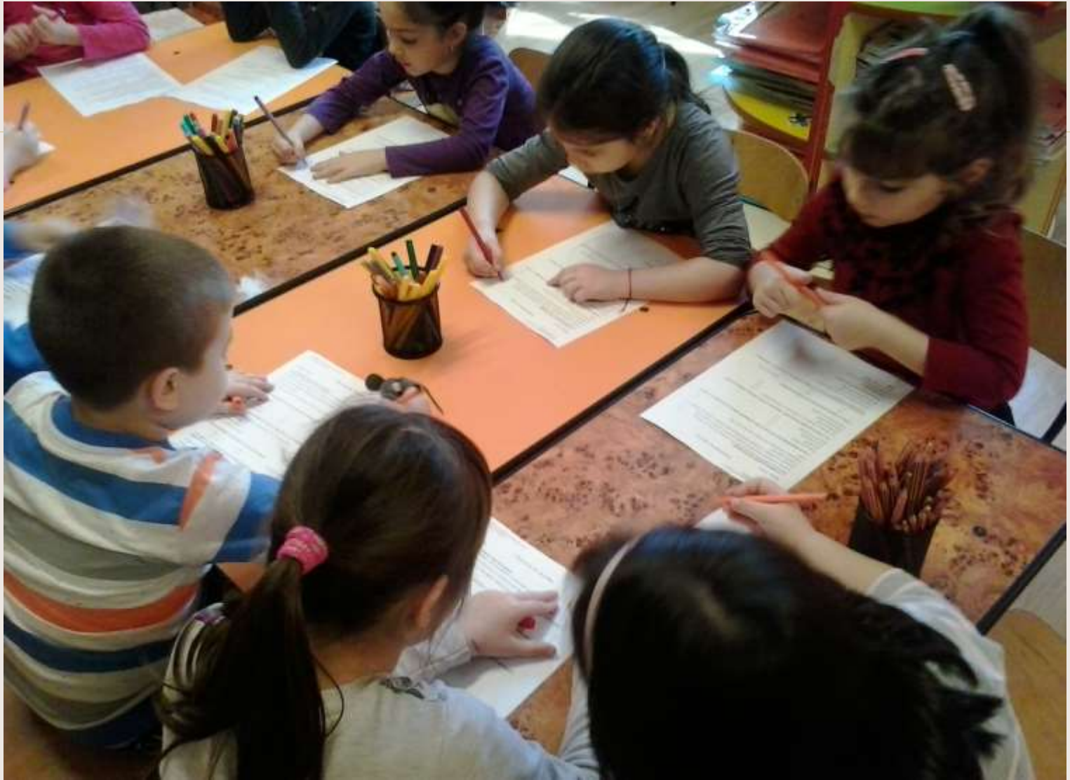
Researching from the school library to improve the environment